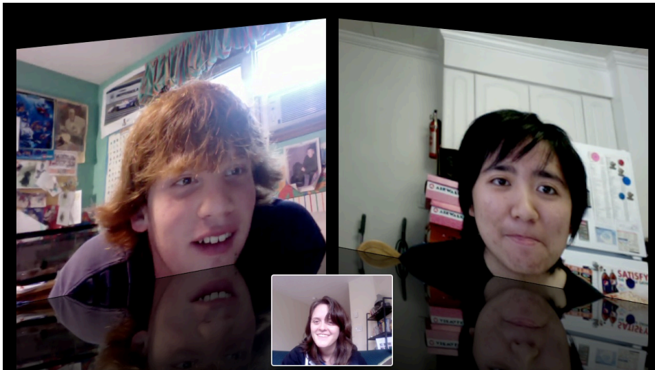
iChat Video Quality.